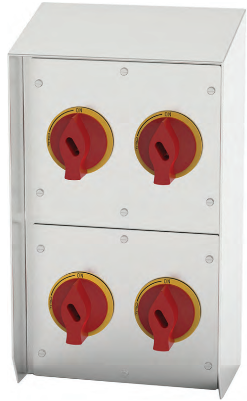
Stainless Steel Sloped Roof Enclosure with 4 Motor Disconnects

For one thing, auxiliary contacts have speed differences based on their actuation methods. Cam actuated versions provide fast and predictable early break switching. Our onboard cam-actuated auxiliary contacts will provide a minimum, repeatable time gap of 20 ms between the opening of the auxiliary and the opening of the mains. This repeatability and speed provide an advantage over